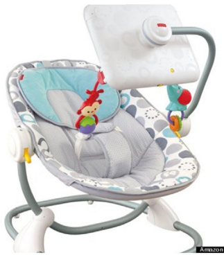
Fig. 5. An iPad for entertaining a baby.

article describes the problem in great depth [45]. An empirical study of the problem was published in 2013 [46].