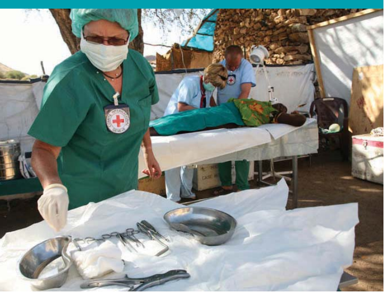
This medical group, based in Nyala, Sudan, flies or drives to combat zones, with virtually no medical facilities and are protected under IHL.

safeguarding healthcare in armed conflict and other situations of violence