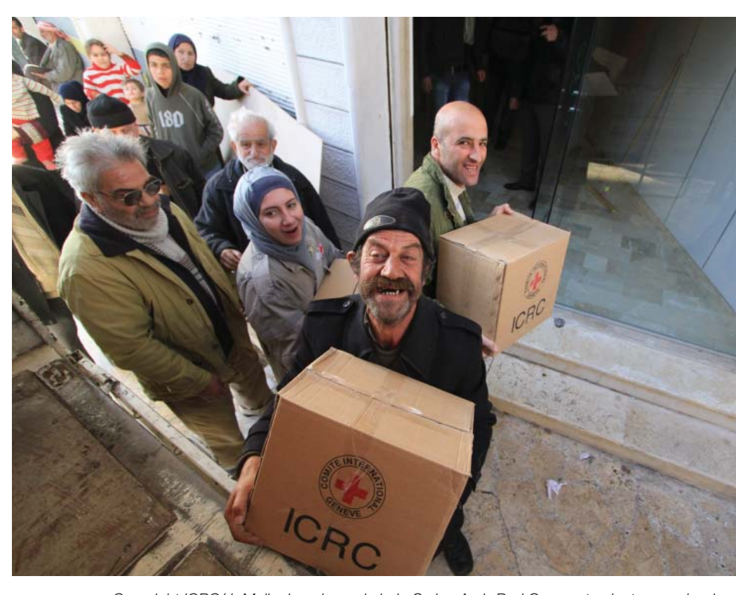
Local people help Syrian Arab Red Crescent volunteers unload food parcels for distribution to people who have fled their homes.

In the sphere of information gathering and sharing, and needs assessment, for example, the everincreasing availability of new web-