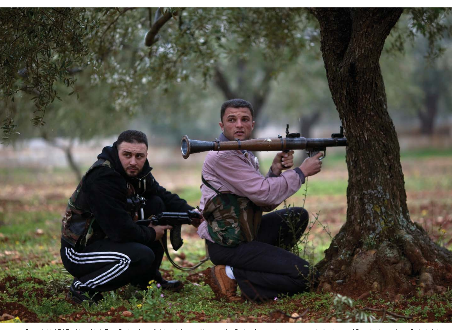
Free Syrian Army fighters take positions as the Syrian Army advances towards the town of Sarmin, in northern Syria in late February 2012. The difficulties for humanitarian agencies to deliver humanitarian assistance to the people of Syria resulted in heavy international criticism.

On the other hand, humanitarian response itself is increasingly within the remit of new actors responding to humanitarian emergencies internationally, including the private sector, new non-governmental organisations, and foreign military forces, often with ways of operating that are different to traditional approaches and not necessarily based on humanitarian principles. This increasingly calls into question the "value add" of traditional humanitarian actors, as well as existing coordination mechanisms by which they operate. This has been demonstrated in Afghanistan, as it has in other situations of armed conflict, where competition between humanitarian actors has resulted in some compromising on humanitarian principles in order to gain profile and resources. Consequently, traditional humanitarian actors who insist on the