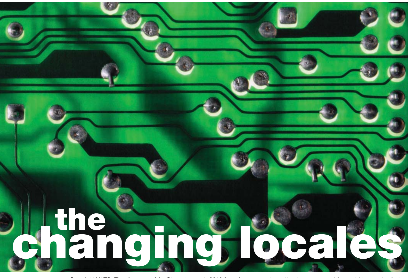
The discovery of the Stuxnet worm in 2010 forced governments and businesses around the world to examine their security defences more rigorously. Cyber threat to real world infrastructure is now topping the security agenda for organisations worldwide. (Source Symantec Critical Informatica Infrastructure Protection survey, August 2010)