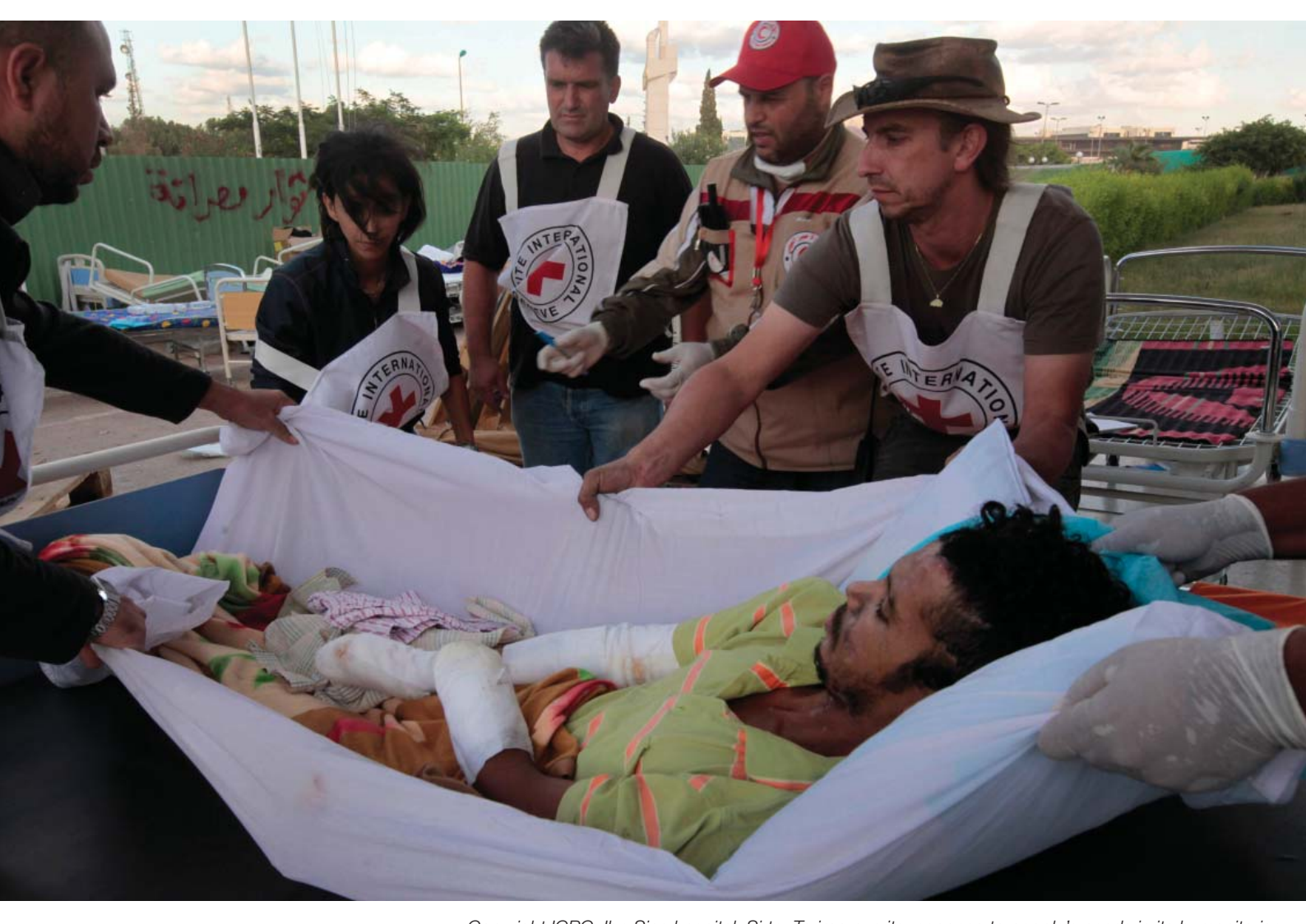
Ibn Sina hospital, Sirte. To improve its response to people's needs in its humanitarian operations, the ICRC is increasingly turning to geographic information systems.

Crisis maps may also be deployed to capture incidents in conflicts and wars as they happen. During the recent revolution in Libya, for example, the Libya Crisis Map tracked, among other events, the movement of refugees, food and water requests, and the evolving situation on the battlefield (see www. libyacrisismap.net). The United Nations' Office for the Coordination of Humanitarian Affairs (OCHA) initiated the Libya Crisis Map in order to improve their situational awareness of this complex and changing environment. This map helped identify gaps in humanitarian assistance and provision, and to chart next steps.