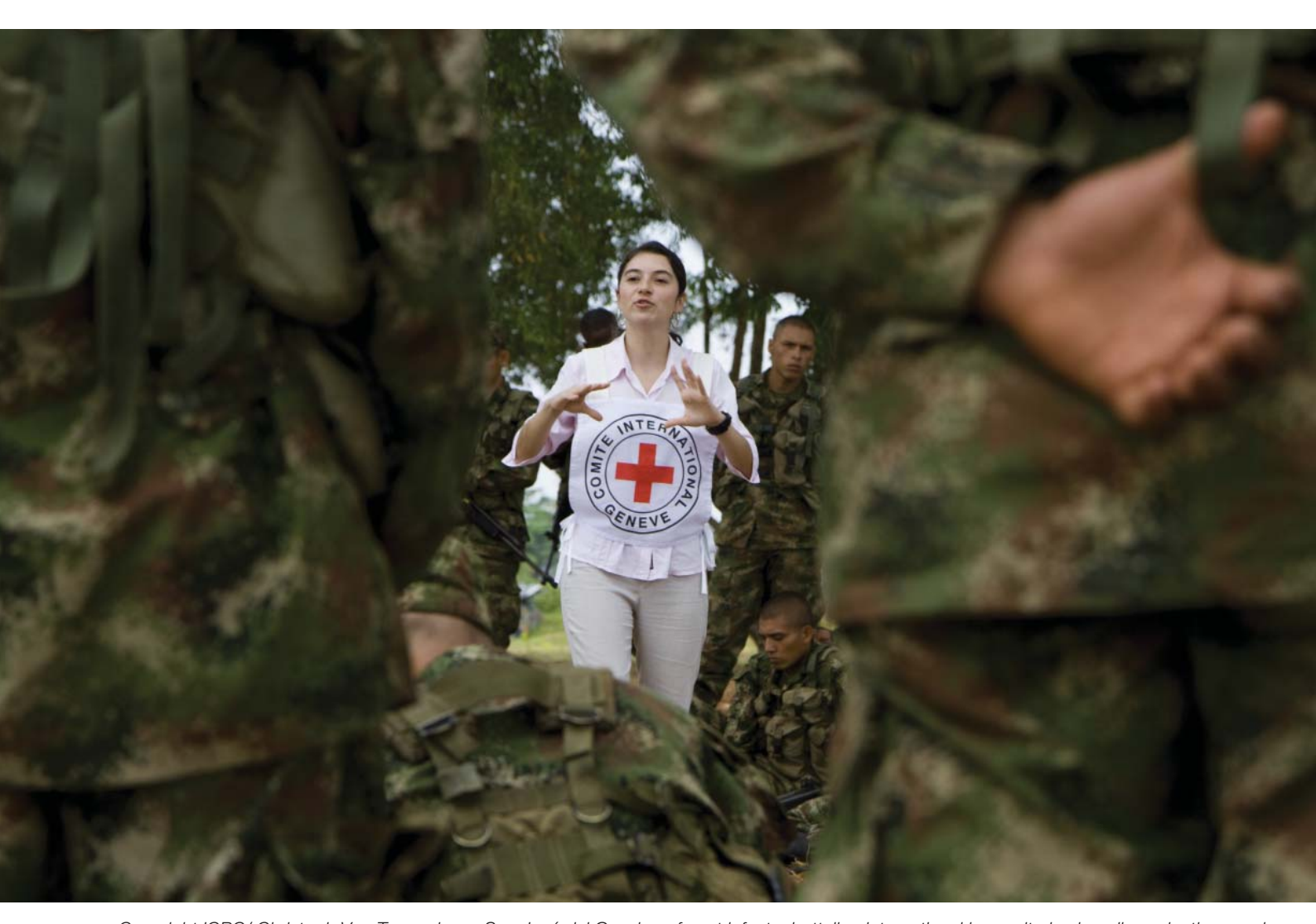
San José del Guaviare, forest infantry battalion international humanitarian law dissemination session. The importance of dialogue cannot be underestimated and proximity to the beneficiaries entails engagement with all actors.

started supporting their military actions with aid campaigns aimed not only at protecting their troops, but also contributing to stabilisation strategies. It is no surprise that donor states and host states want humanitarian action to contribute to their own national interests. Indeed, we find it normal and right that states deliver humanitarian aid to their populations in times of conflict or disaster. And while we all know that humanitarian action cannot happen in a vacuum, the problem arises precisely when objectives become blurred, in other words when aid is prioritised and allocated on political, military or economic objectives rather that on the basis of humanitarian needs.