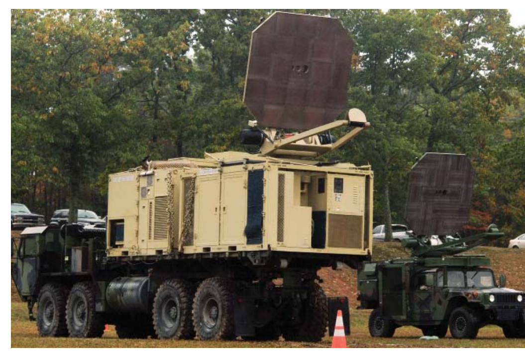
Two US Marine Corps vehicles mounted with the Directed Energy Active Denial System, a non-lethal weapon that uses directed energy. When fired at a human, it delivers a heat sensation to the skin and generally makes them stop what they are doing and run.

Indeed, there seems to be budding acceptance of the inevitability of the growth in non-lethal weapons technology and use. This is not necessarily deleterious, but it must be balanced against the awareness that the preservation of fundamental IHL principles is imperative. The Geneva Conventions have been signed by every nation in the world. Although not perfect, these vital documents contain the very basic provisions for the preservation of humanity in times of armed conflict and have, in the midst of humanity's most horrible pursuit, brought about the alleviation of much suffering. Directed against combatants, it is conceivable that nonlethal weapons could create a more humane form of warfare. However, the temptation to blur the principle of distinction in the age of non-lethal weapons to allow the sorts of actions mentioned in the previous paragraph, whilst understandable, will ultimately lead to an undermining of the Geneva Convention's central tenets and consequently greater human suffering.