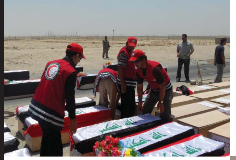
Iraqi Red Crescent Society staff prepare coffins for handover from the Kuwaiti authorities to the Al Zubair Centre of the Iraqi Ministry of Human Rights.

the role of human rights in situations of armed conflict: lessons from the european court of human rights