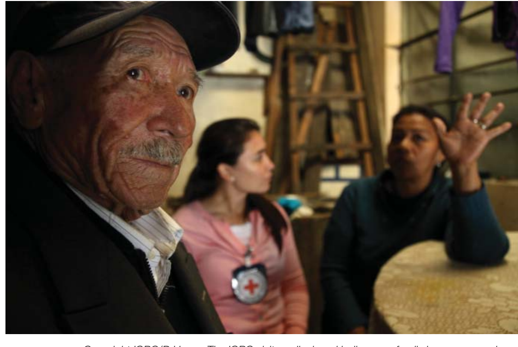
The ICRC visits a displaced indigenous family in a poor area in the south of the city of Bogota, Colombia. Offsetting a decline in "traditional" violence is the steady rise in both the scope and the humanitarian consequences of situations of violence below the threshold of international humanitarian law.

So what does all this imply for us? How does it affect us and the way we work, now and in the coming years? We are observing various trends in armed conflicts and other situations of violence that will ultimately have an impact on how humanitarian actors