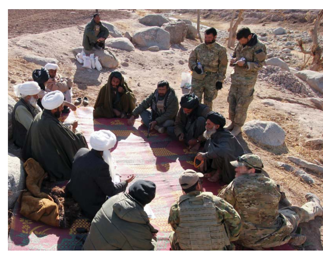
Top left: Members of the Special Operation Task Group (SOTG) provide security as the Australian SOTG legal officer attends a Shura (consultation) with officials from the Afghan Ministry of Justice at the Tarin Kowt Court House.

The views expressed in this article are solely those of the author and do not necessarily represent the views of the Royal Australian Air Force or the Department of Defence.