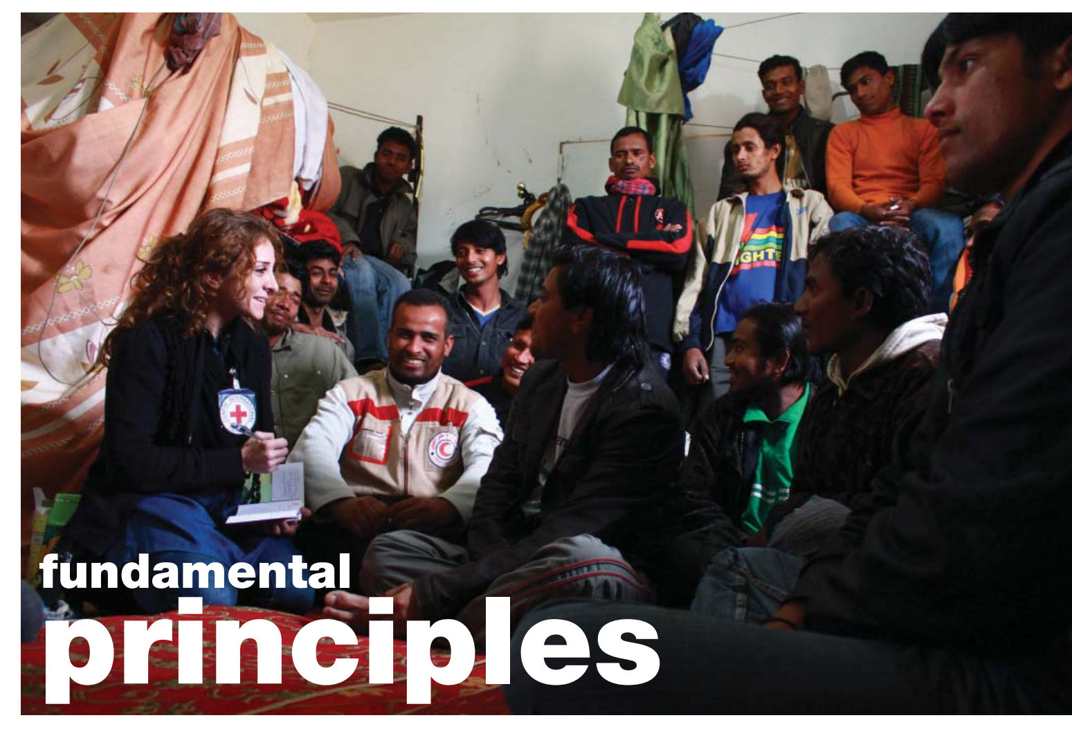
Ajdabiya, Libya. An ICRC delegate and a Libyan Red Crescent volunteer talk to stranded Bangladeshis who had been working for a road cleaning firm before fighting broke out in Libya.